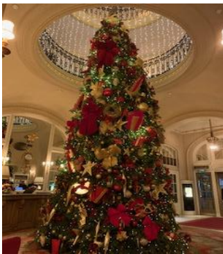
Christmas Tree The Ritz London.

Below are a couple of photos from our European trip in December.