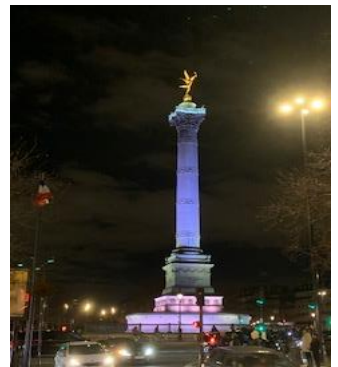
Bastille Paris France

That's it from my desk! If you have any questions or have a trip you think we should look at – let me know!