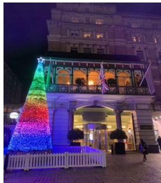
Theatre District London