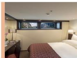
Panorama Suites Cat A, B & P

Why not combine the Changers n Chateaus tour and enjoy a relaxing river cruise after the tour?