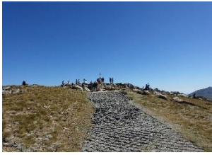
Almost at the summit

Whilst in Thredbo choose a walk either to the Summit of Mt Kosciusko, to Dead Horse Gap or just a walk around the village of Thredbo. More information on this trip will be out in September.