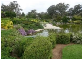
Japanese Gardens Cowra

This 3 night 4 day trip is in the planning stages at the moment. This will be a tailored tour which will include food and wine tours mixed with heritage tours, historical village tour in and around the towns of Orange, Milthorpe, Cowra, and Grenfell.