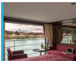
Deluxe Stateroom Cat E