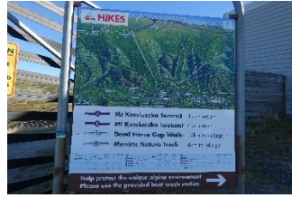
suggested walks available