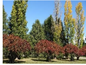
scenery on way to Tumut