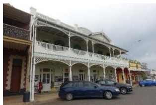
Historic building Grenfell