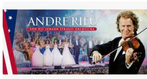
Rieu and his Johann Strauss Orchestra ...