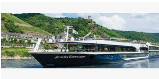
River Cruise Ships - Avalon Waterways®