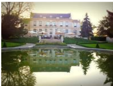
Chateau De Rilly

Teasers for our Champers and Chateaux 2022 tour.