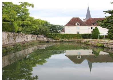
Chateau De Gilly 2 places we stay on the Champers n Chateau tour